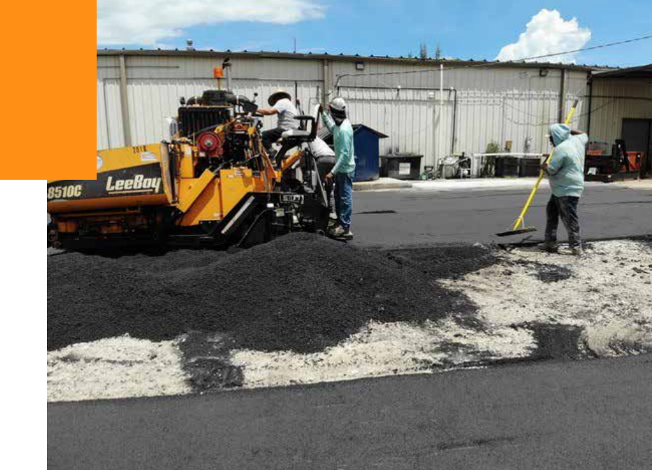
ARMI and ACE XP are easily adopted into any asphalt plant production through metered dosing using Line Vac, MD3, or Sentinel dosing units supplied by Surface Tech.

Surface Tech is committed to developing the most advanced reinforcement solutions for asphalt, not only adding strength and durability, but improving the sustainability. Our innovative processes, technologies and products make asphalt pavements better, stronger and longer-lasting. Extensive research and development, laboratory testing and field trials have proven the Surface Tech advantage. We're paving the way to a sustainable future.