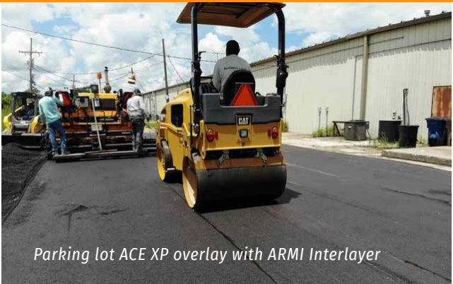
Parking lot ACE XP overlay with ARMI Interlayer

Rose Paving constructed 100,000 square feet remove and replace, installing 6" asphalt pavement section utilizing Surface Tech's ACE XP™ polyaramid fibers supplied by Kiewit Infrastructure. Not only was the project finished faster than the original 8" design, Beacon Roofing saved $34,615.44.