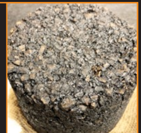
AEGIS : Soaked 24hrs in Kerosene