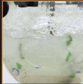
Functionalized Polyester Resin (Reacted with 40% recycled PET)