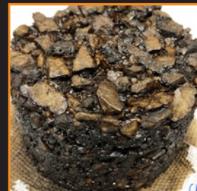
Control: Soaked 24hrs in Kerosene